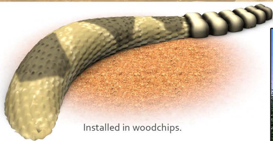
Installed in woodchips.