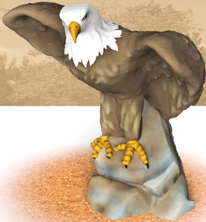
Installed in woodchips.