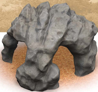
Installed in woodchips.